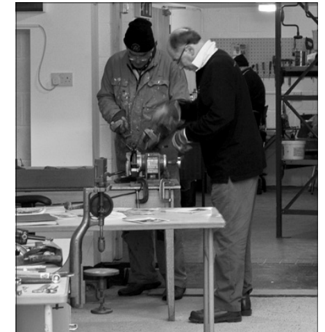
TWAM volunteers renovating old tools