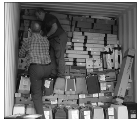
These tools are being packed into containers and being shipped overseas to Zambia