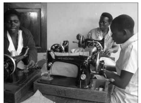
The tools are to be used by people in their villages to become more self sufficient