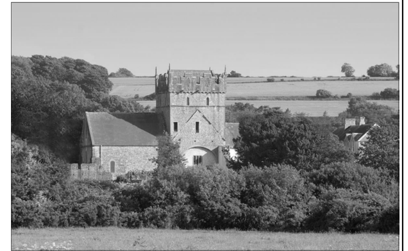
Ewenny Priory and Church in Ewenny, Vale of Glamorgan

The residents of Ewenny Village are very pleased that the Ewenny Community Council has, with the help of grant funding from Creative Rural Communities, The Welsh Aggregates Levy and Tidy Towns, refurbished the playground which is situated on the Wick Road and has been a playground since 1938 with only one piece of play equipment in place. The newly refurbished playground was officially opened on 5 th December 2010 by Alun Cairns MP with the Mayor & Mayoress of the Vale of Glamorgan, Jane Hutt AM and a large number of local residents and children in attendance. Refreshments were served in the Village Hall and a good and enjoyable time was had by all.